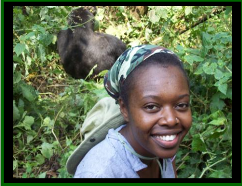
Gorilla Tracking, Uganda