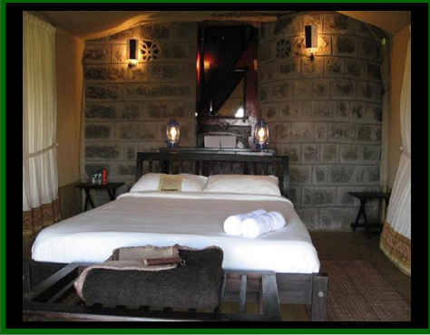
Maili Saba, Nakuru

PIN NO: P051236195L | PO BOX 75777 – 00200 NAIROBI 2 ND FLOOR, NYAKU HOUSE, ARGWINGS KODHEK ROAD, HURLINGHUM 254 20 271 4214 | 254 722 332 515 | 254 738 068 582 info@exclusivecotravels.com | www.exclusivecotravels.com