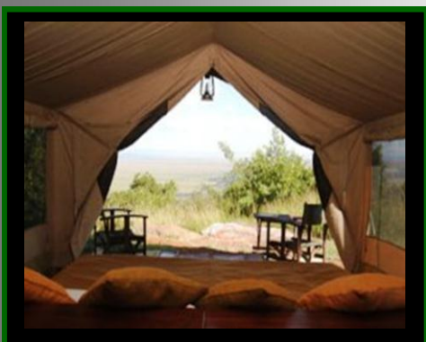
Kilima Safari Camp, Mara