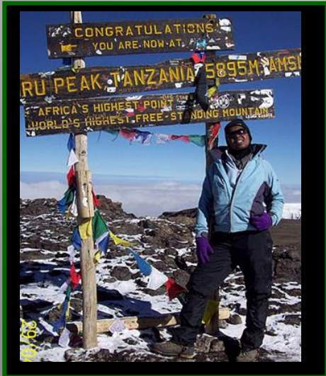
Mount Kilimanjaro, Tanzania