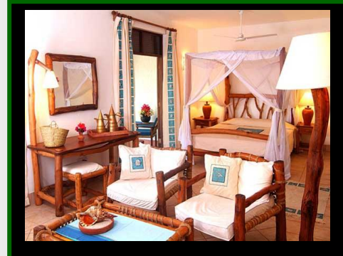
Pinewood Village, Galu Beach

COMPANY PROFILE We define ourselves as creators of worthwhile and lasting leisure experiences for the person who is particular on their comfort and conveniences and is looking to have a memorable experience. So this is what we ask you to expect from us when we arrange your leisure activities for a holiday trip, an accommodation facility, an out of town excursion or bonding activity. Our region of operation is within East Africa: Kenya, Uganda, Tanzania & Rwanda You may be looking for a romantic getaway, a honeymoon, alone time to re-charge, a family holiday or even to bond with friends or work colleagues....if it's your leisure time that you're looking to spend; constructively of course! We have various options for you to consider.