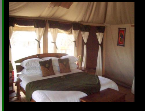
Elephant Bedroom Camp, Samburu